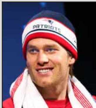
TOM BRADY Patriots quarterback

"[I'm glad] we're going someplace warm, because I'm freezing my you-know-what off."