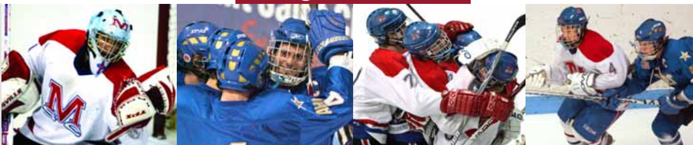
MINNESOTA'S STARS TOP MOUNT: View the gallery at HSGameTime.com/rhodeisland

Tell us what you think at projsports.com/patriots